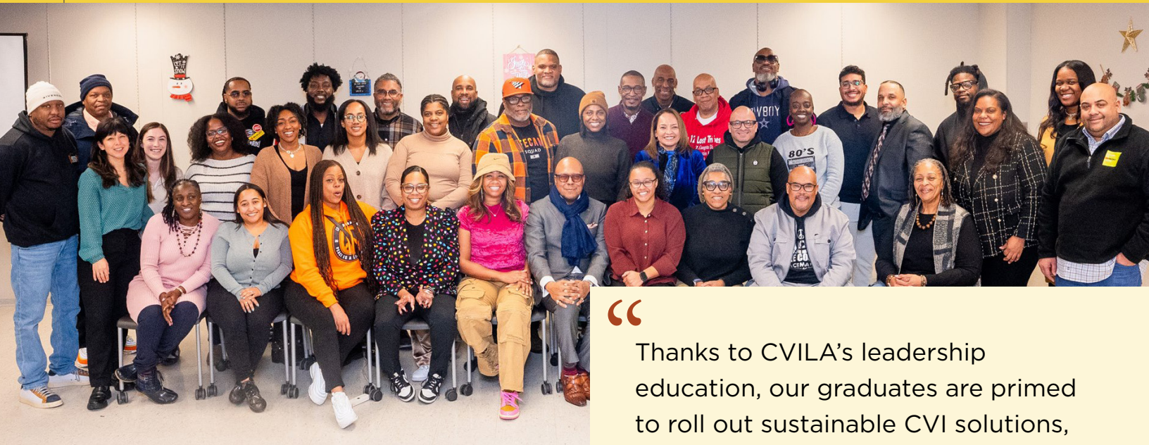
CVILA students and instructors in Chicago, IL for an Immersive Lab with UCAN.

Empowering Leaders to Close America's Safety Gap